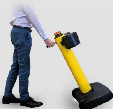
Easy to move and set up