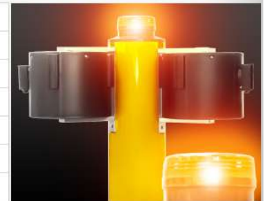
Flashing light option for low light visibility.